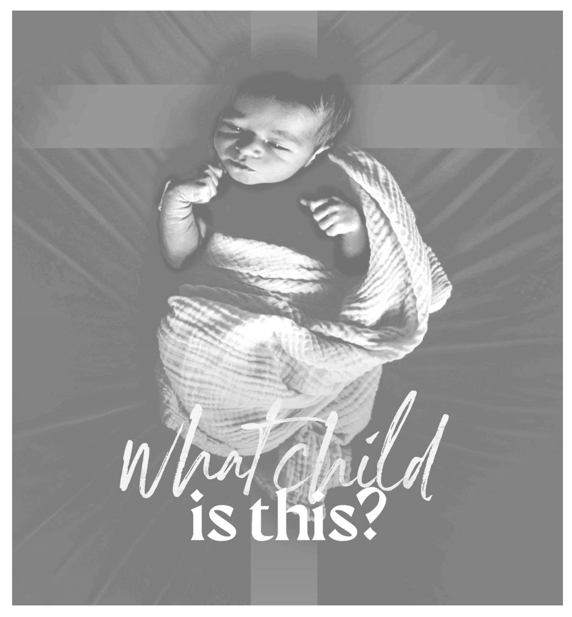
Christmas Day 9:30am